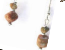
Black Agate Manifesting® Faith Double Drop Earrings