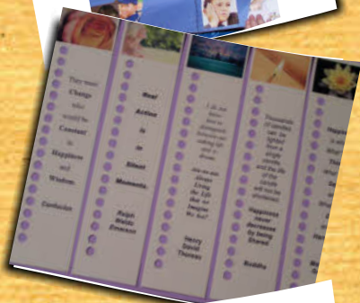
Tigereye Manifesting® Bookmark