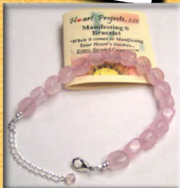
NEW! Rose Quartz Adjustable Manifesting® Bracelet

To learn more about Heart Projects' other Manifesting Products, including our Manifesting® Key Chains and Manifesting® Bookmarks, we invite you to visit us at www.Manifesting.us .